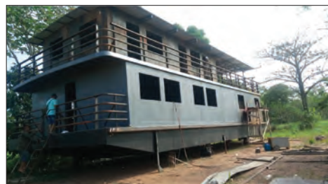
Boat used for tourism that will be used for missions off-season

There is a Christian man in the city nearby that works with