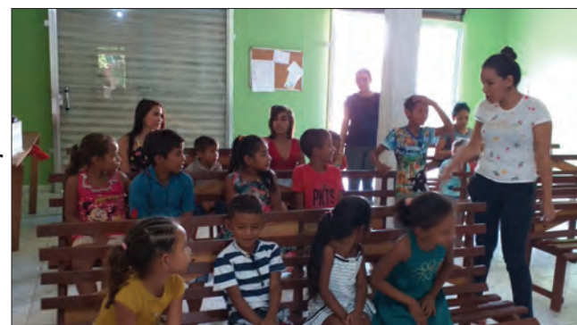
New building at Iranduba