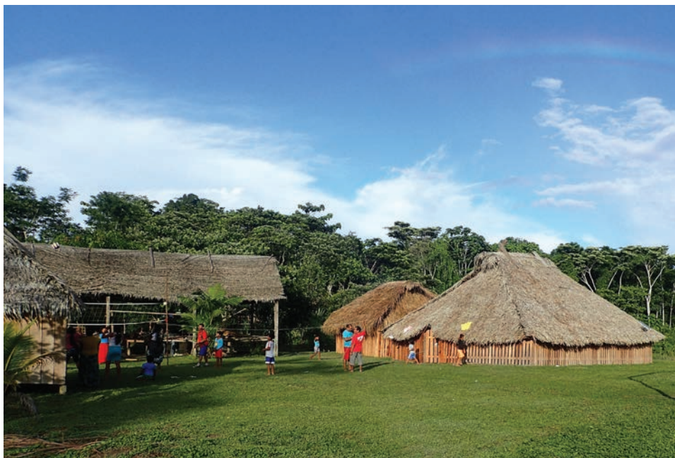
The great house at the center of the Hunikuim Village

"Please pray for us as we try to keep pushing the gospel to the most remote places on earth."