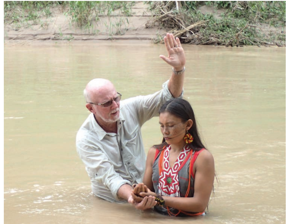
Baptismal service in the Hunikuim Village