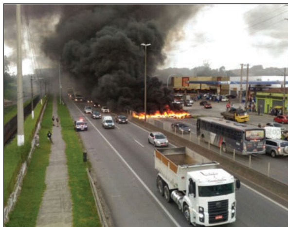
Rioters ignited tires blocking roads in São Paulo.