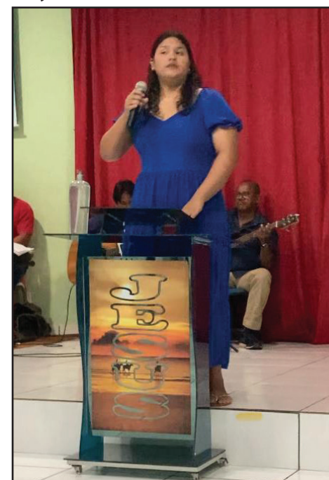
Youth helping in ministry

View more pictures on our FaithWorks Blog! bfmnow.org/faithworks-blog