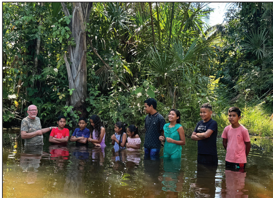
The baptism at the Nukini Indian Reservation

August 22, 2024 Dear Brethren, Greetings from....Lexington, Kentucky? That's right. I am back in the States for more cancer surgery. Was under the knife for 4 and a half hours a few days ago. All is well and I am recovering nicely. Hope you will be patient with me and continue to pray. One extra blessing is that I get to go over and see Dad every day. He just turned 98 and is in pretty good shape. Also, I am getting rested up and I am already desperate to get home and back to work. Patience is needed though as I still have 2 weeks of recovery before I can go back home.