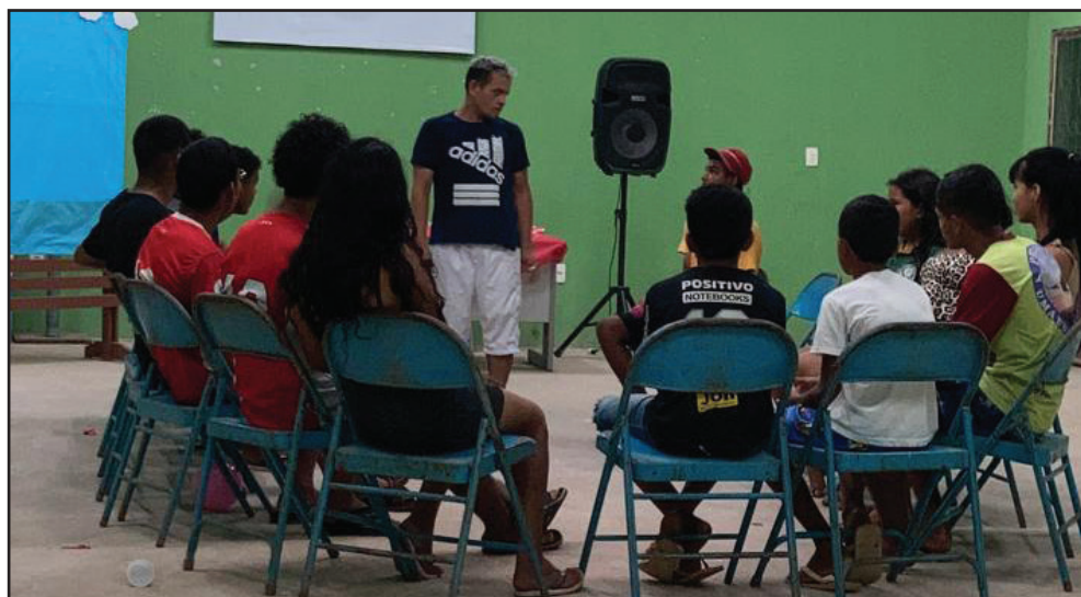
Young man helping at Ubim